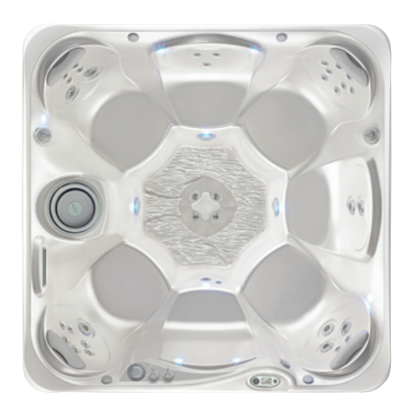
Rhythm spa shown with Pearl shell