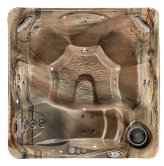
Tempo spa shown with Tuscan Sun shell