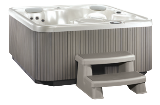
SX spa shown with Pearl shell, Coastal Gray cabinet, and Polymer step