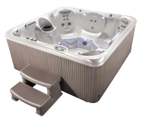
Rhythm spa shown with Pearl shell, Coastal Gray cabinet, and Polymer step