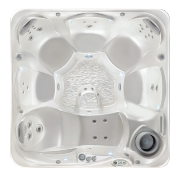
Relay spa shown with Pearl shell