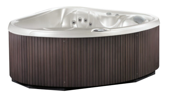
TX spa shown with Pearl shell, Espresso Cabinet