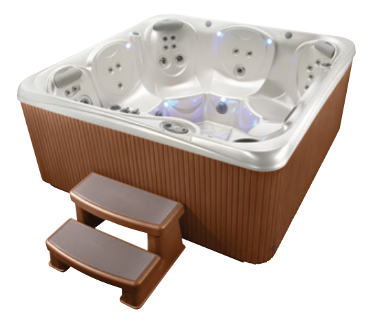
Relay spa shown with Pearl shell, Teak cabinet, and Polymer step