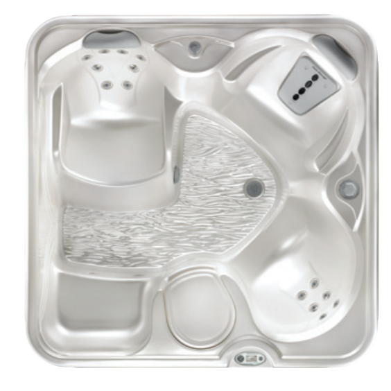
SX spa shown with Pearl shell

SX and TX models are available in a choice of three cabinet colors and two shell colors.