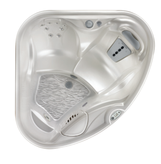
TX spa shown with Pearl shell