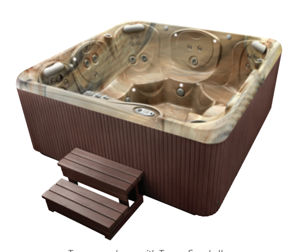
Tempo spa shown with Tuscan Sun shell, Espresso cabinet, and Everwood® step