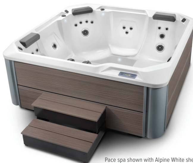
Pace spa shown with Alpine White shell, Havana cabinet and Havana Hot Spot Collection Step.