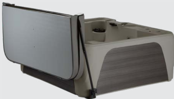
Entice® Premier shown with Taupe shell and Charcoal cabinet with Slate cover and lifter