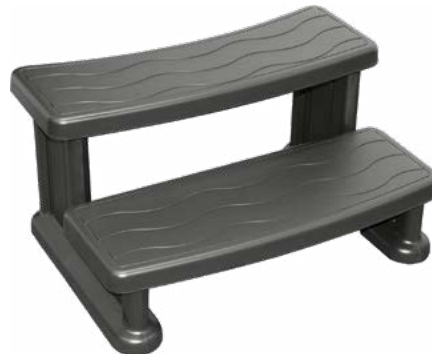
Shown in Charcoal