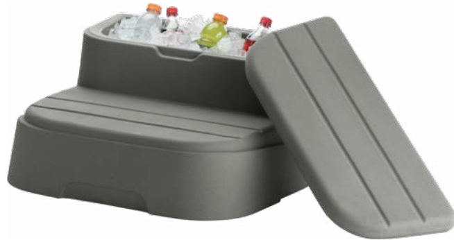
Shown in Taupe

Pairs With: Premier Series: Enamor®, Entice®; Sport Series: Aspire®, Drift®, Embrace®, Enamor®, Entice®