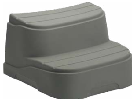
Shown in Taupe