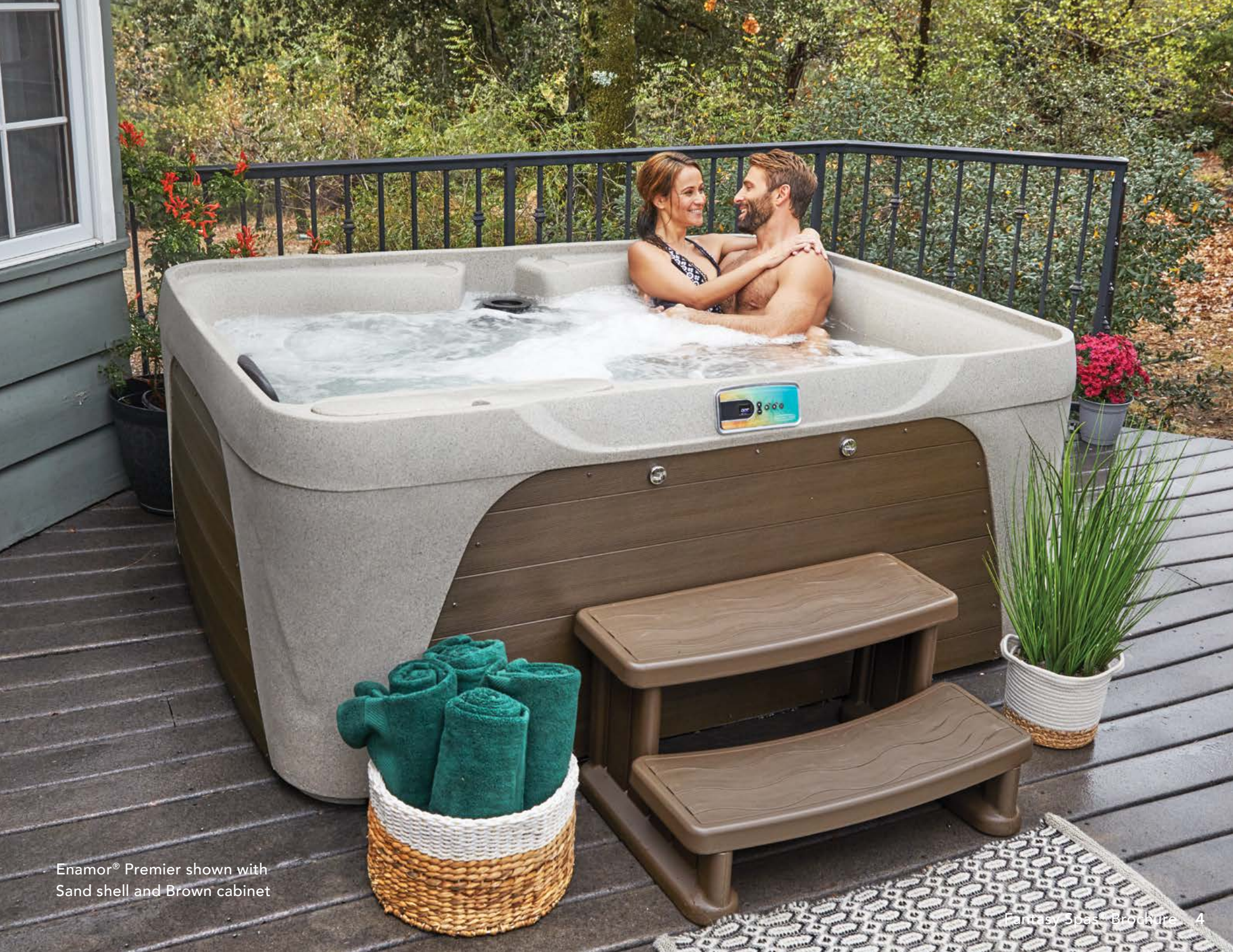
Enamor® Premier shown with Sand shell and Brown cabinet