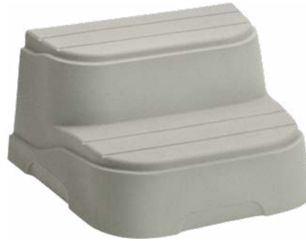
Shown in Sand