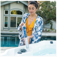
Frog® @ease® In-Line Cartridge Ready