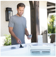
FreshWater® Salt System Ready