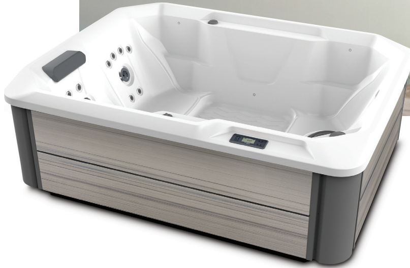
Shown with Alpine White Shell and Almond Cabinet.

People Seating Jets Voltage 3 Seats Lounge 20 Jets 115 V or 230 V