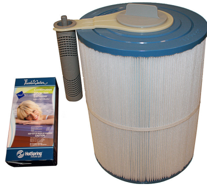
FreshWater Ag+ Adapter attached to a Limelight Filter (65 sq. ft.)