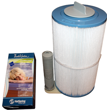
FreshWater Ag+ Adapter attached to a Hot Spring Filter (Tri-X® or Standard Paper 30 sq. ft.)

The FreshWater Ag+ adapter gives a Hot Spring® Spa or Limelight® hot tub owner the ability to use the FreshWater Ag+ Silver Ion Cartridge and ACE® System simultaneously. The following instructions illustrate how to attach the FreshWater Ag+ adapter to either a Hot Spring® Spa or a Limelight® hot tub: